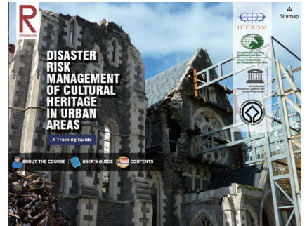
Training Guide of Ritsumeikan University, UNESCO Chair programme, International Training Course on Disaster Risk Management of Cultural Heritage