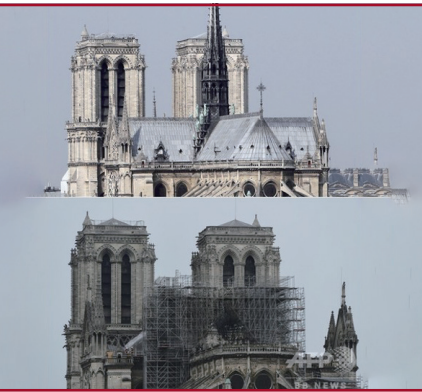
Notre Dame Cathedral damaged from large scale fire (2014 [one on the top], 2019 [one on the bottom]), Paris, France