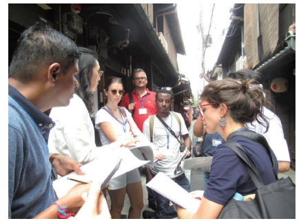
Ritsumeikan University, UNESCO Chair programme, International Training Course on Disaster Risk Management of Cultural Heritage