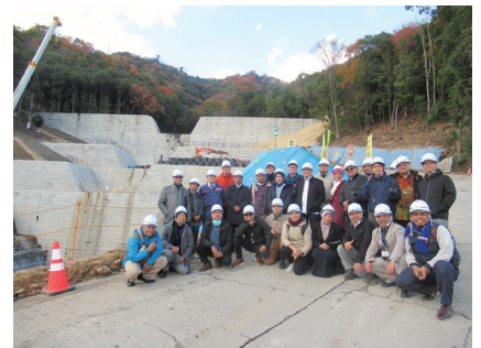
Ritsumeikan University, Indonesian government training