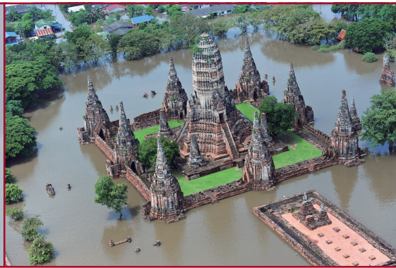
Temple submerged in flood water (Year: 2011, Ayutthaya, Thailand)