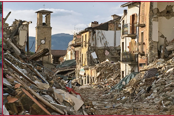
Medieval township destroyed by earthquake (Year: 2016, Amatrice, Italy)

Many of the world heritage sites are located in earthquake-prone zones, such as the Pacific Rim and the Himalayan orogenic belt.