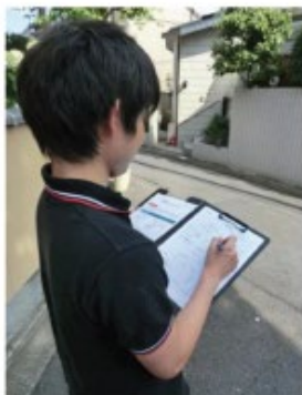
Making a note in the map

Please take pictures as considering what kind of pictures is easy to understand for the people who are not familiar with the places.