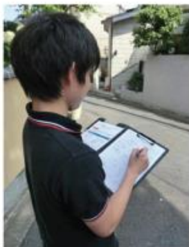
Making a note in the map