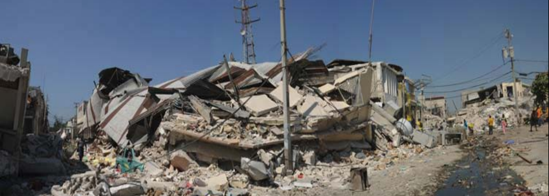
La Rue Pavée, Port au Prince, 12 January