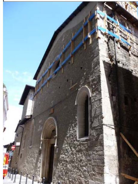
Example of the polyester strapping system on L'Aquila from "Protection of the cultural heritage in the post-earthquake emergency" by C. Modena and L. Binda.