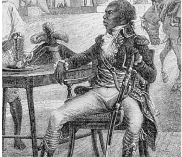
General François-Dominique Toussaint L'Ouverture, leader of the Haitian Revolution.

The Haitian Revolution was quite complex with competing agendas of white colonists, gens de