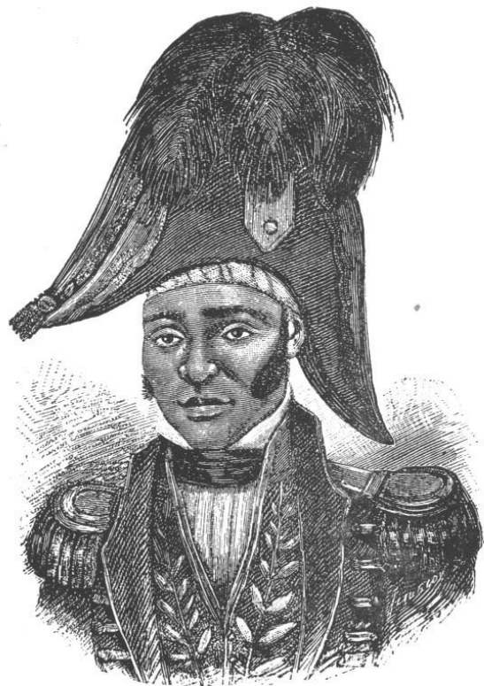
General Jean-Jacques Dessalines, a leader in the Haitian Revolution and first ruler of independent Haiti