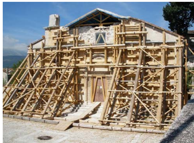
Shoring of the façade of Santa Giusta church in Bazzano from “Protection of the cultural heritage in the post-earthquake emergency” by C. Modena and L. Binda.