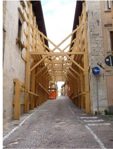
Example of the contrast system used in L'Aquila from "Protection of the cultural heritage in the post-earthquake emergency" by C. Modena and L. Binda.

Reconstruction of collapsed structural elements. In the event of partial collapse, it will often be necessary to restore the physical continuity of the wall before the straps are fitted. This is done by either filling the gaps or replacing collapsed parts with braces or horizontal shores or by temporarily rebuilding the ruined wall.